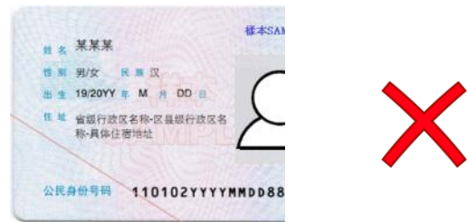
*Information shown is incomplete