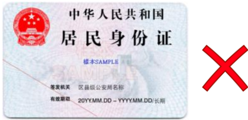
*Front side of the resident ID card