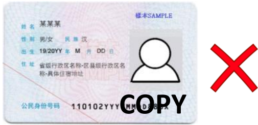
*Resident ID number not clearly shown