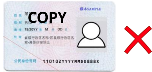
*Full name shown is not clear